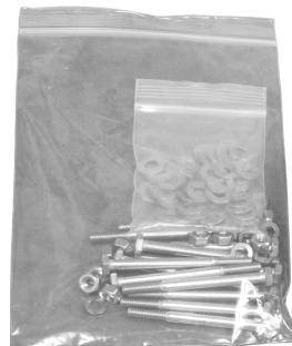
SM-FLGRD64 BOLT KIT